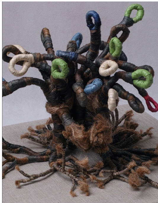
"Tree Hug", which was inspired by a hollow oak Tree at West Dean, West Sussex.