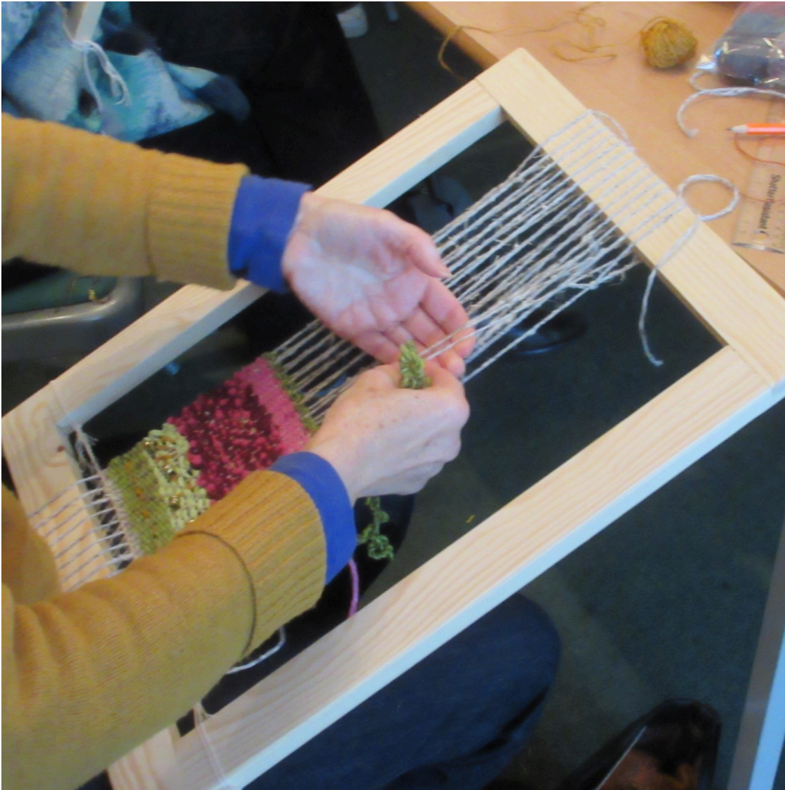
Art Textile Weaving Workshop at Brighton Buddhist Centre, 7th March, 10.30 - 4.30pm Book Here