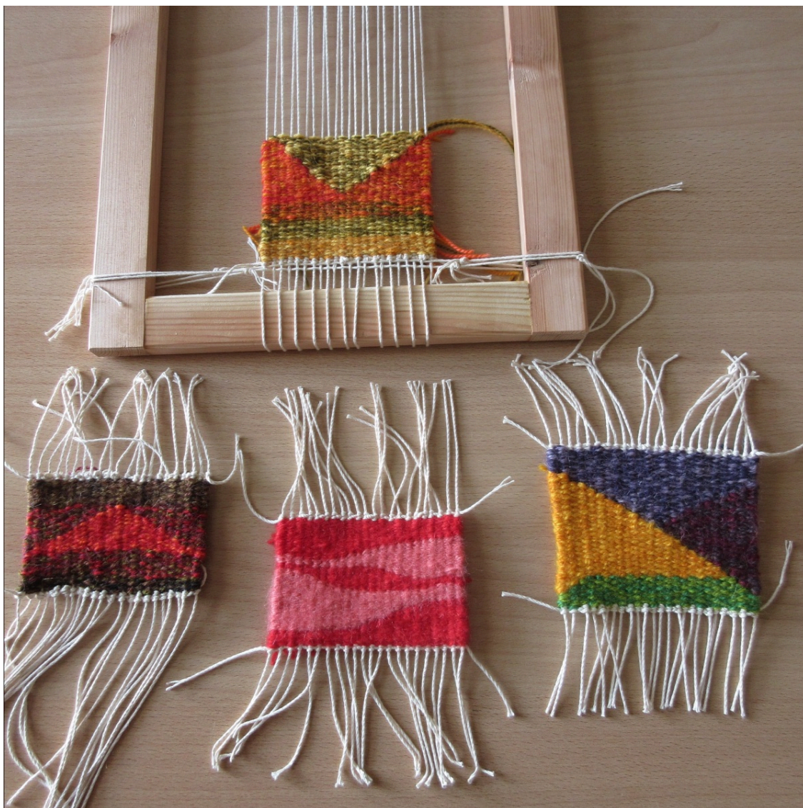
Art Textile Weaving Workshop

7th March 2026, at Brighton Buddhist Centre, 10.30 - 4.30pm